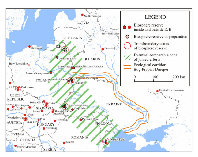
Figure 1. The map of Transboundary Chain of East European Biosphere Reserves with Zone of Joint Efforts

Mentioned areas on the Eastern border of European Union are currently under focus of such international organizations as Man and Biosphere UNESCO, which are performing some initiatives in this region. It started with the international project "Establishment of a Transboundary Biosphere Reserve and a Regional Ecological Network in Polesie" launched by three countries: Belarus, Poland and Ukraine. The project consists of